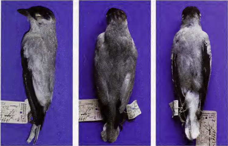
Figure 2 (left). Lateral view of the holotype of White-tailed Tityra Tityra leucura (E. Bauernfeind)